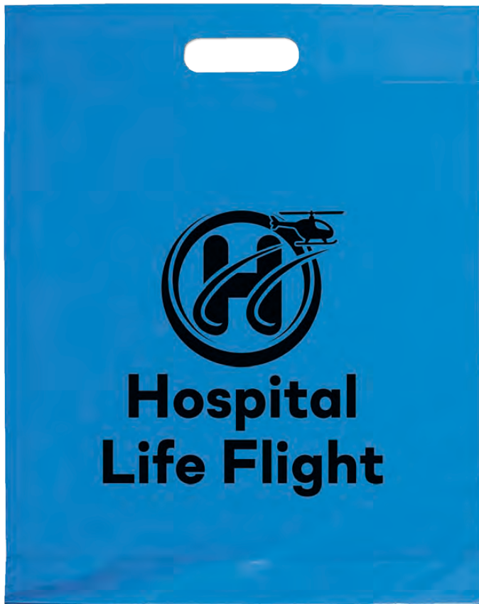
15W x 19H x 3 FLEKO INK PRINT