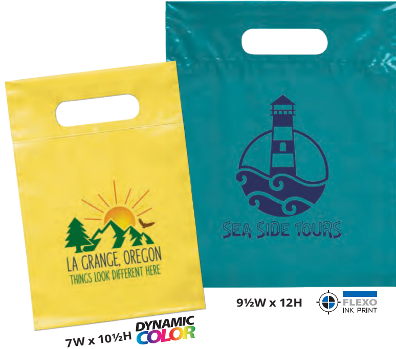
7W x 10½H DYNAMIC COLOR

These 2.5 mil lo-density plastic bags feature fold-over reinforced die cut handles. Bottom gusset is available on select sizes.